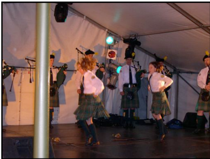
Top: Celtic Moon Festival

All of our recent performances have boosted interest in the pipe band and dance school, with many new learners coming along over the past few months to learn instruments and to join the dancers. This is the best way that we have of recruiting people for the band, so don't forget to make sure that you have a supply of business cards to hand out to people at events or any time that you are out and about practising or playing in public.